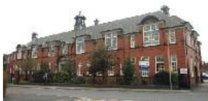
Leigh Girls Grammar School Possibly to be demolished in 2007

the sexes separated, girls going to the purpose-built premises for them in Windermere Road. Part of their playground was laid out on land that had formerly belonged to the Cleworth's farm. My mother, too, attended the Grammar School: her best subjects were languages and music, and I still have some of the prizes she won there. She played the piano, and also the organ: for a time she was the Chapel organist.